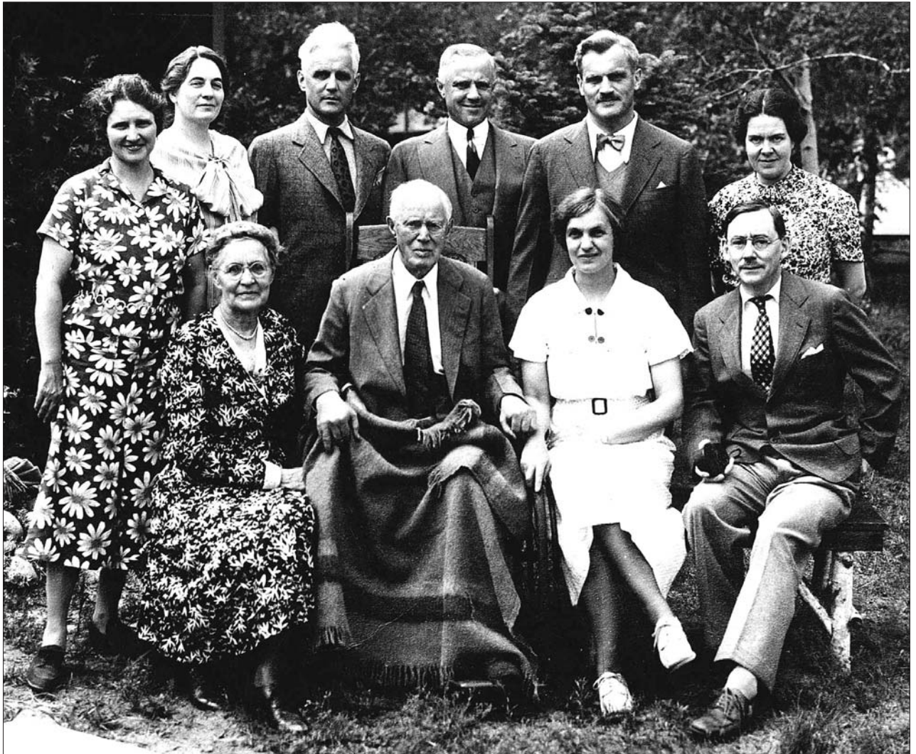
The Compton family—all four siblings, their spouses, and their parents— at their summer home on Otsego Lake, near Gaylord, Michigan, ca. 1937.

Science fit into this picture in at least two ways. First, Compton quite literally saw divine providence at work in atomic energy. Given that supplies of fossil fuels are dwindling, "atomic energy is coming just in time to meet a fundamental human need." "Is it surprising," he asked more than rhetorically, "if we should see here working the hand of Providence?" We needed fossil fuels to reach our