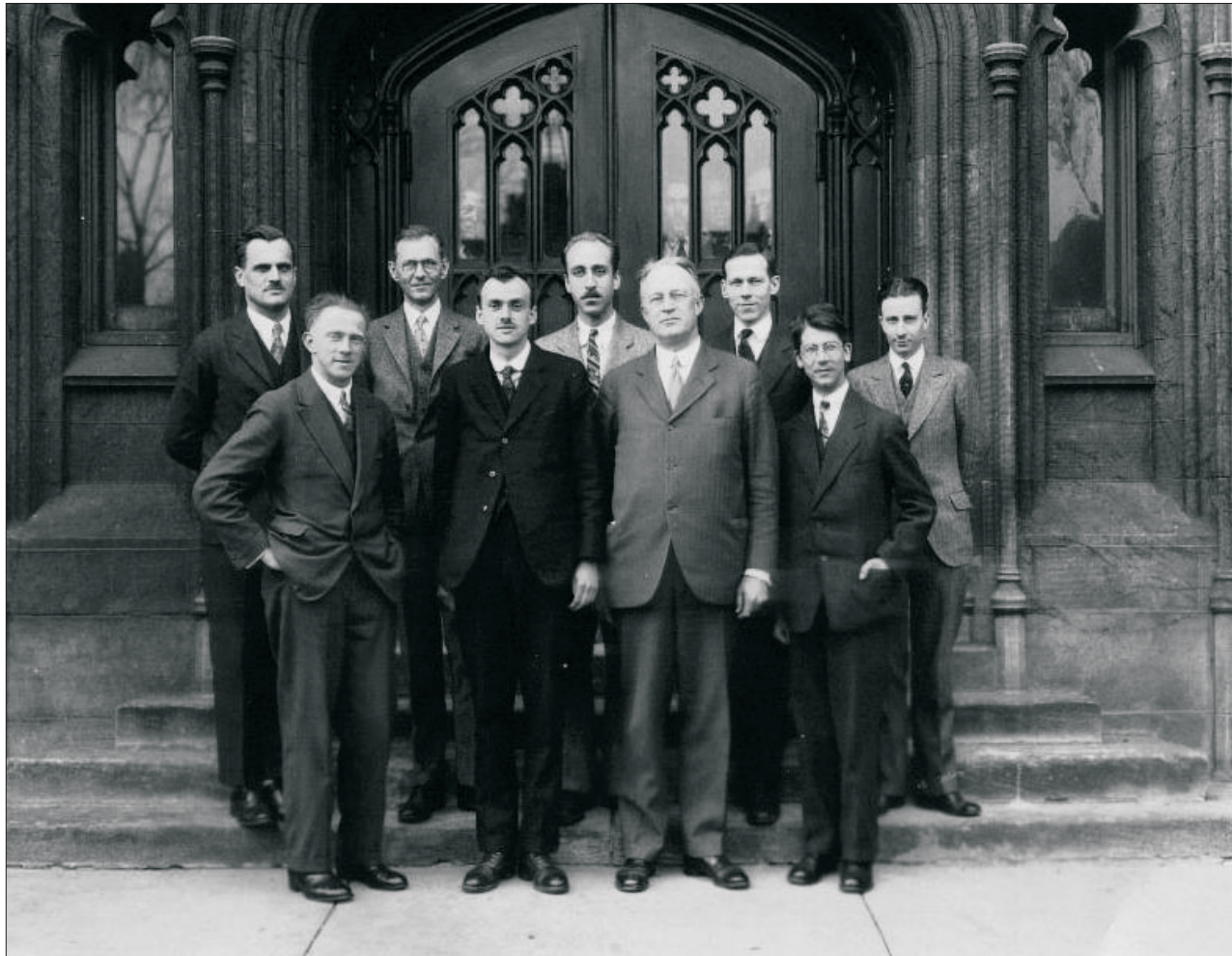
Physicists gather in front of the Ryerson Physical Laboratory in Chicago in 1929, probably in April or May in connection with Heisenberg’s lectures.

Following Dampier, Compton presented Socrates as an enemy of scientific thought, owing to his skepticism and his opposition to the mechanistic thinking of the ancient atomists, which “left no room for that freedom of choice which is the basis of morality ...” When Socrates placed mind over